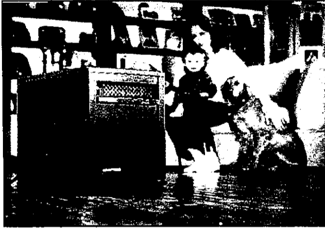
Cannot start a fire; a child or animal can touch or sit on it without harm